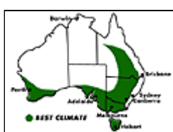
tall fescue turf