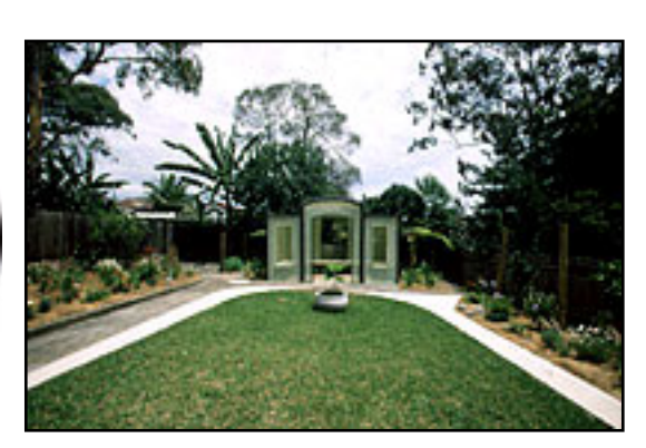
The Backyard Blitz team transformed this average backyard into a bountiful garden that invites you to sit and relax.

Landscape designer Colin Brown created the design which would utilise the good points of the garden and introduce some other functional and attractive elements as well. The plan was to retain the established lawn trees and shrubs, to create a kitchen garden at the back steps, a summerhouse for entertaining and relaxing surrounded by a bog garden and a cottage garden filled with flowering plants.