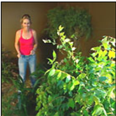
lilly pilly ( Syzygium 'Cascade')

Blitz Tipz: Be sure to provide shelter for the birds to protect them against the elements.