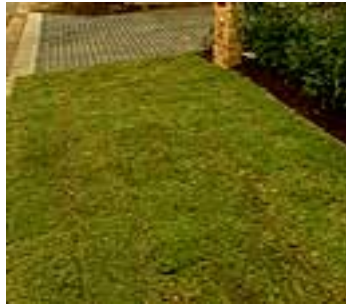
Buffalo 'Sir Walter'