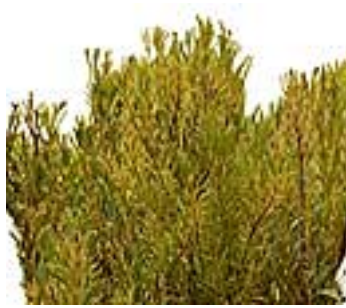
dwarf lilly pilly