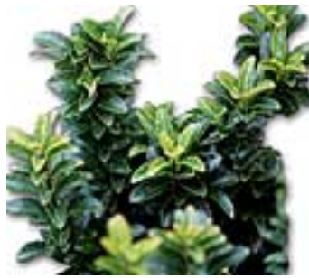
euonymus 'Tom Thumb'