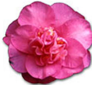
camellia 'Jennifer Susan'