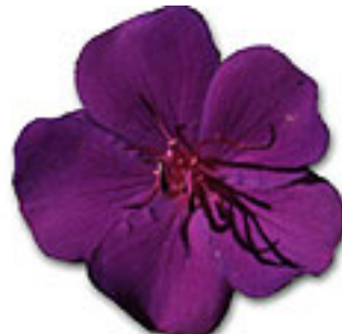
dwarf lasiandra ( Tibouchina 'Jules')