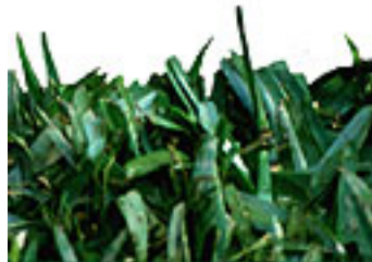
soft buffalo 'Palmetto'